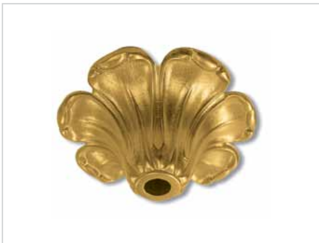
G393 L85 x W85 x H32 foro/hole Ø10,5 piano sopra/round flat Ø15