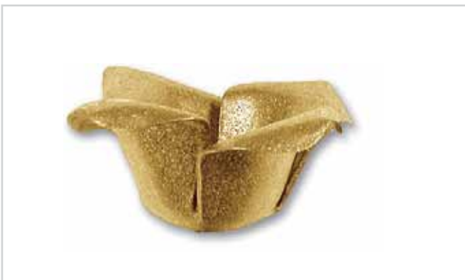
Z281 L80 x W80 x H40 · foro/hole Ø10,5 piano sopra/round flat Ø16