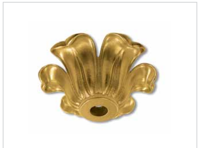
18-060 L82 x W82 x H31 foro/hole Ø10,5 piano sopra/round flat Ø21