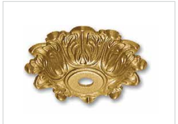
18-014 Ø85 x H17 foro/hole Ø10,5 piano sopra/round flat Ø22