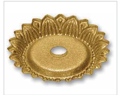
G054 Ø65 x H9 foro/hole Ø10,5 piano sopra/round flat Ø35