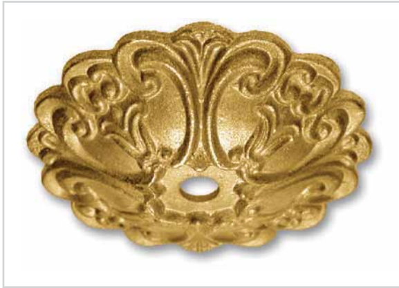
G151 Ø50 x H11 · foro/hole Ø10,5 piano sopra/round flat Ø13 stampato - printed