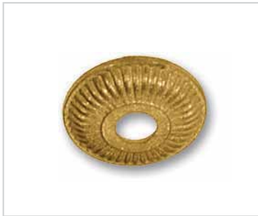
G050 Ø40 x H15 foro/hole Ø10,5 piano sopra/round flat Ø17