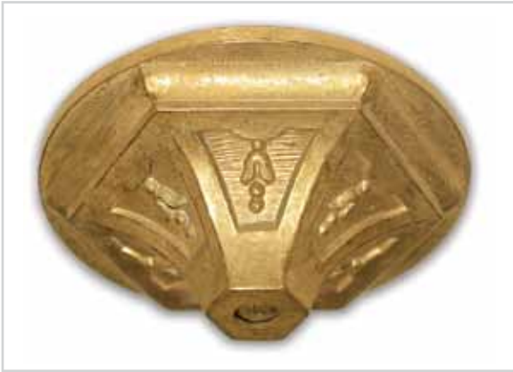
G389 Ø100 x H38 · foro/hole Ø10 piano sopra/round flat Ø20,5