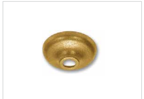
G352 Ø50 x H17 · foro/hole Ø10,5 piano sopra/round flat Ø15