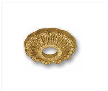
G026 Ø35 x H10 foro/hole Ø10,5 piano sopra/round flat Ø14