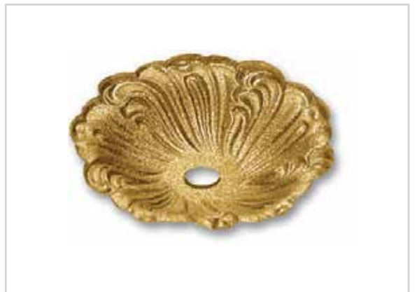
G077 Ø80 x H15 foro/hole Ø10,5 piano sopra/round flat Ø20