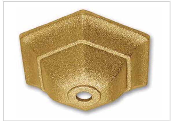
G458 L70 x W30 x H25 · foro/hole Ø10,5 piano sopra/round flat Ø17