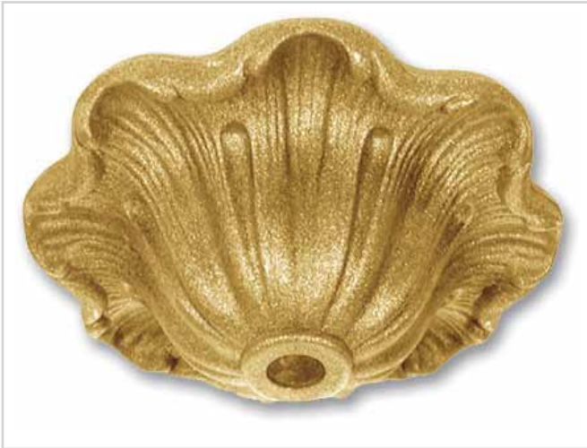
G367 Ø75 x H26 · foro/hole Ø10,5 piano sopra/round flat Ø19