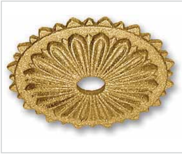
G013 Ø65 x H9 foro/hole Ø10,5 piano sopra/round flat Ø15