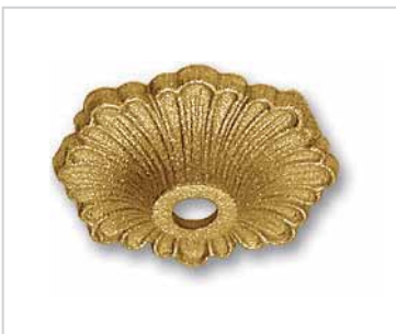
G028 L52 x W52 x H13 foro/hole Ø10,5 piano sopra/round flat Ø13