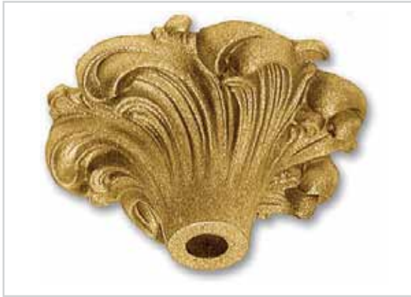
G331 L65 x W65 x H30 foro/hole Ø10,5 piano sopra/round flat Ø13