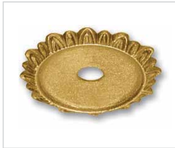
18-034 Ø58 x H5 foro/hole Ø10,5 piano sopra/round flat Ø35