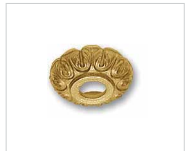
18-037 Ø32 x H10 foro/hole Ø10,5 piano sopra/round flat Ø14