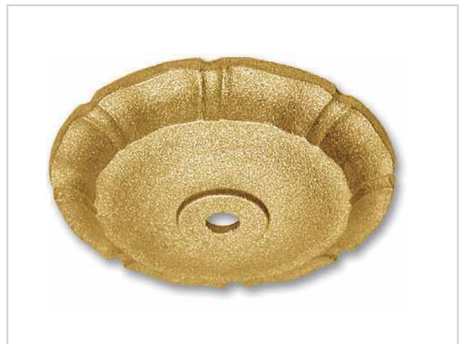
G446 Ø100 x H18 · foro/hole Ø10,5 piano sopra/round flat Ø24