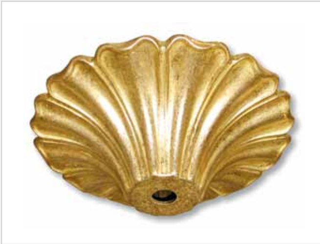
18-068 Ø120 x H35 foro/hole Ø10,5 piano sopra/round flat Ø14