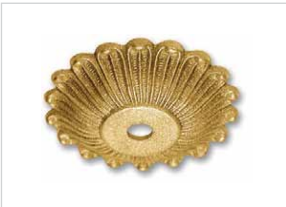
G236 Ø82 x H17 foro/hole Ø10,5 piano sopra/round flat Ø30