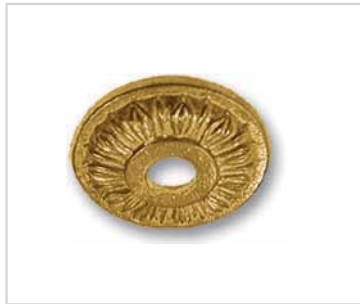
G027 Ø40 x H15 foro/hole Ø10,5 piano sopra/round flat Ø17