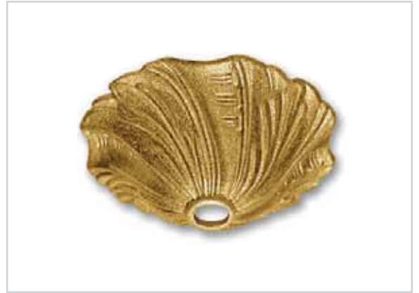
G314 Ø60 x H30 foro/hole Ø10,5 piano sopra/round flat Ø13