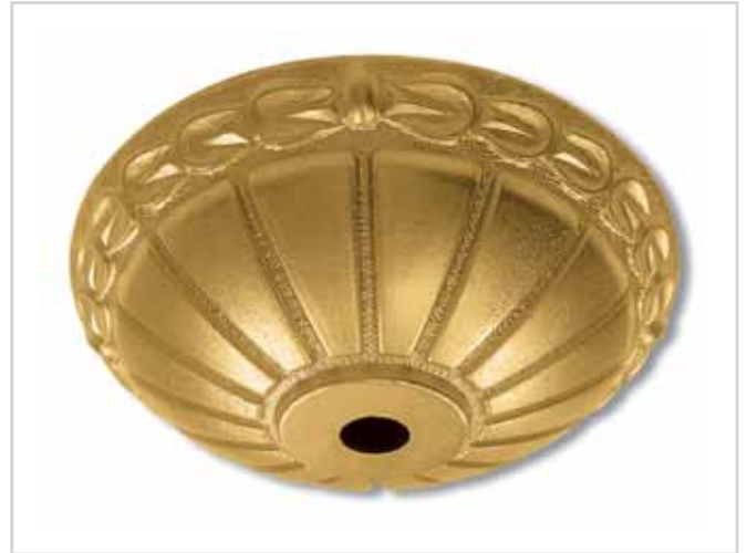
18-066 Ø100 x H30 foro/hole Ø10,5