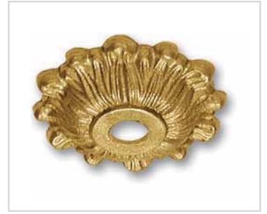
18-033 Ø56 x H12 foro/hole Ø10,5 piano sopra/round flat Ø19