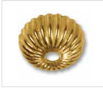
G125 Ø50 x H20 foro/hole Ø10,5 piano sopra/round flat Ø17