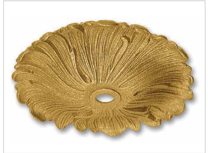
G358 Ø75 x H14 · foro/hole Ø10,5 piano sopra/round flat Ø15