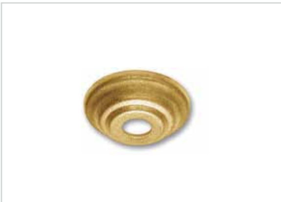
18-055 Ø40 x H12 · foro/hole Ø10,5 piano sopra/round flat Ø17