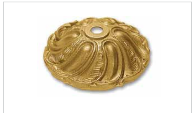
G405 Ø93 x H29 · foro/hole Ø10,5 piano sopra/round flat Ø18