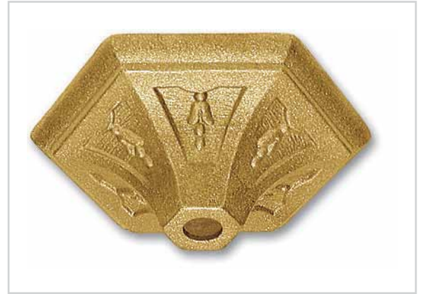
G390 L98 x W86 x H35 · foro/hole Ø10,5 piano sopra/round flat Ø12