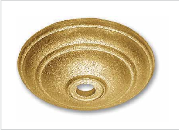
G241 Ø88 x H20 · foro/hole Ø10,5 piano sopra/round flat Ø17