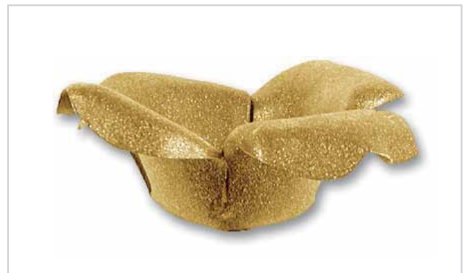
Z280 L100 x W100 x H30 · foro/hole Ø10,5 piano sopra/round flat Ø16