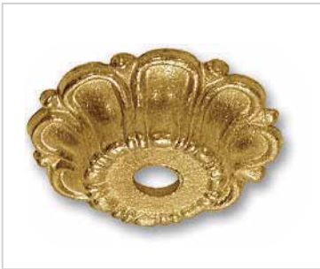
G029 Ø58 x H10 foro/hole Ø10,5 piano sopra/round flat Ø21