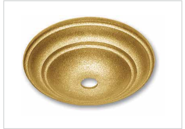
18-051 Ø83 x H19 · foro/hole Ø10,5 piano sopra/round flat Ø25