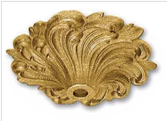
G386 Ø85 x H25 foro/hole Ø10,5 piano sopra/round flat Ø14