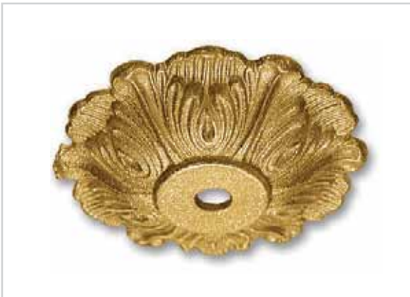
G139 Ø92 x H21 foro/hole Ø10,5 piano sopra/round flat Ø28