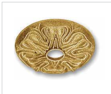
G279 Ø50 x H8 · foro/hole Ø10,5 piano sopra/round flat Ø12