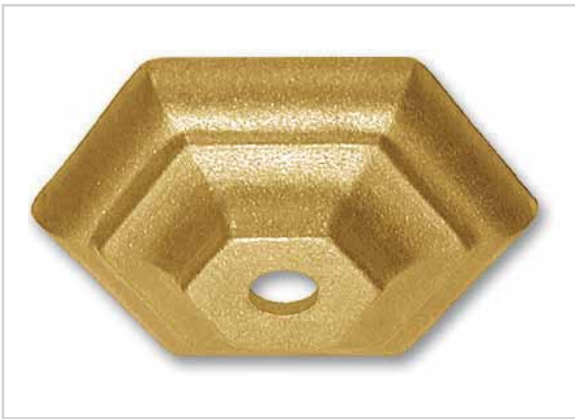
18-057 L80 x W70 x H18 · foro/hole Ø10,5 piano sopra/round flat Ø25