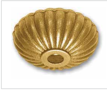
18-030 Ø58 x H23 foro/hole Ø10,5 piano sopra/round flat Ø15