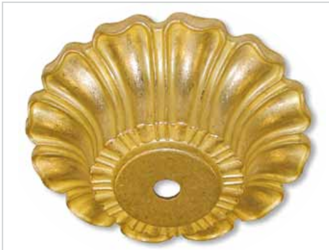
18-069 Ø90 x H30 foro/hole Ø10,5 piano sopra/round flat Ø14