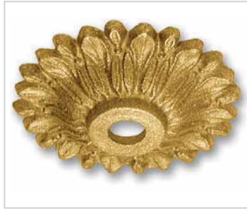
G154 Ø65 x H12 foro/hole Ø10,5 piano sopra/round flat Ø18