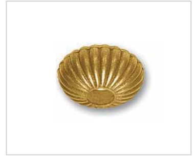
18-038 Ø32 x H10 foro/hole Ø10,5 piano sopra/round flat Ø13