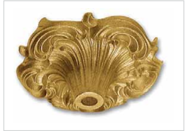
18-042 L80 x W80 x H29 foro/hole Ø10,5 piano sopra/round flat Ø13