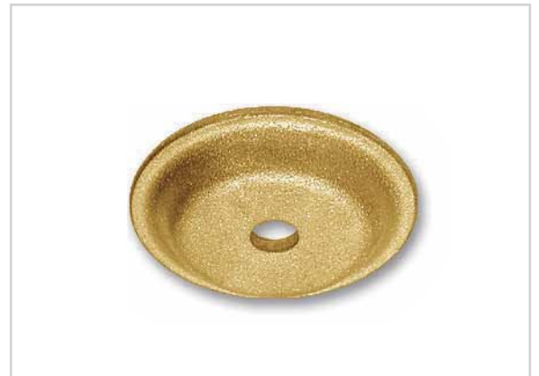
G259 Ø63 x H18 · foro/hole Ø10,5 piano sopra/round flat Ø36