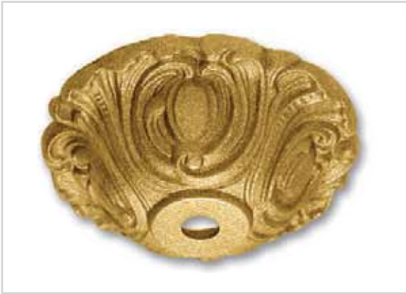
G448 Ø96 x H34 foro/hole Ø10,5 piano sopra/round flat Ø26