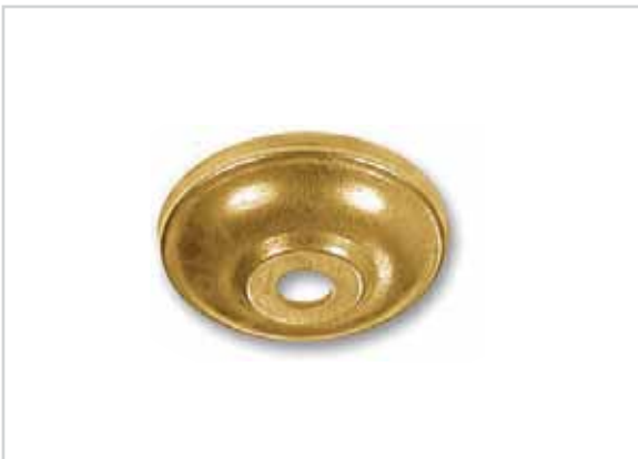
18-054 Ø58 x H14 · foro/hole Ø10,5 piano sopra/round flat Ø17