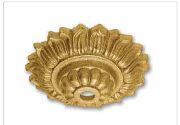
G451 Ø90 x H28 foro/hole Ø10,5 piano sopra/round flat Ø17