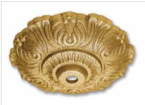
G447 Ø110 x H30 foro/hole Ø10,5 piano sopra/round flat Ø20