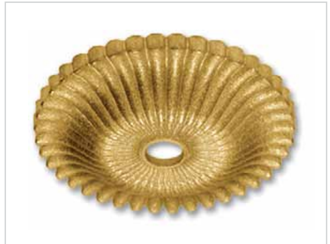
G006 Ø60 x H12 · foro/hole Ø10,5 piano sopra/round flat Ø14 stampato - printed