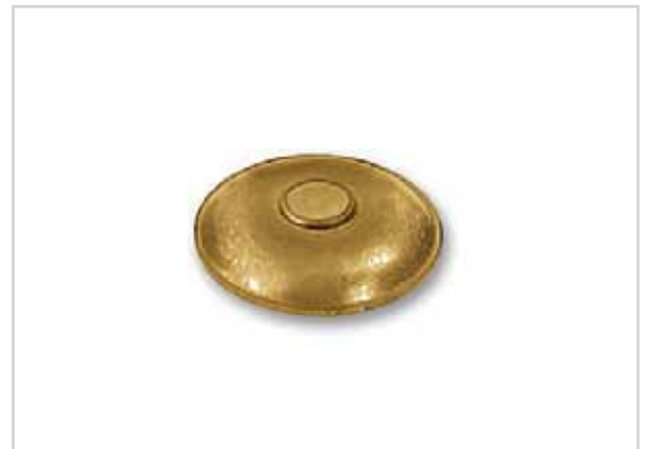
G460 Ø50 x H8 piano sopra/round flat Ø12