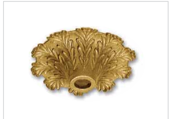
18-026 Ø80 x H25 foro/hole Ø10,5 piano sopra/round flat Ø16