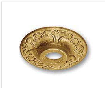
18-036 Ø46 x H8 foro/hole Ø10,5 piano sopra/round flat Ø15