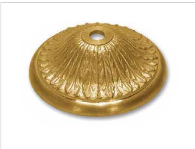
G336 Ø100 x H30 · foro/hole Ø10,5 piano sopra/round flat Ø20