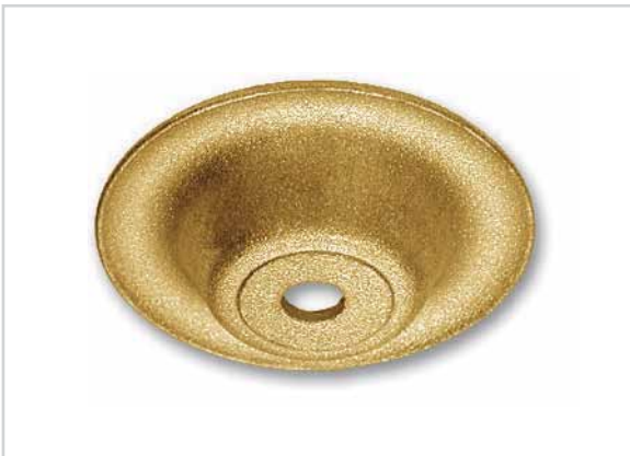
G272 Ø70 x H20 · foro/hole Ø10,5 piano sopra/round flat Ø20