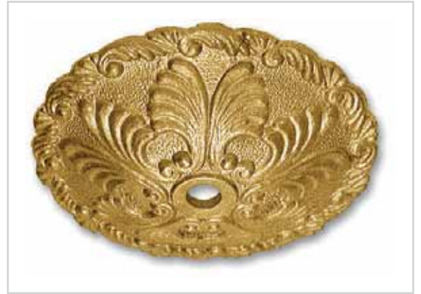
G209 Ø70 x H16 foro/hole Ø10,5 piano sopra/round flat Ø13