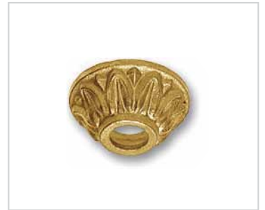
18-039 Ø34 x H15 foro/hole Ø10,5 piano sopra/round flat Ø13