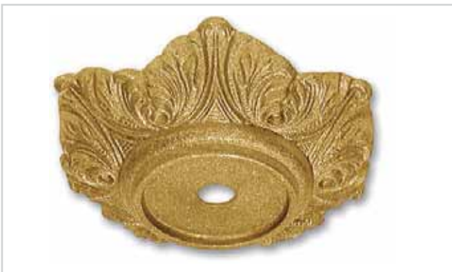
G408 Ø100 x H25 · foro/hole Ø10,5 piano sopra/round flat Ø45