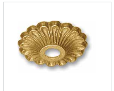
18-035 Ø46 x H8 foro/hole Ø10,5 piano sopra/round flat Ø15