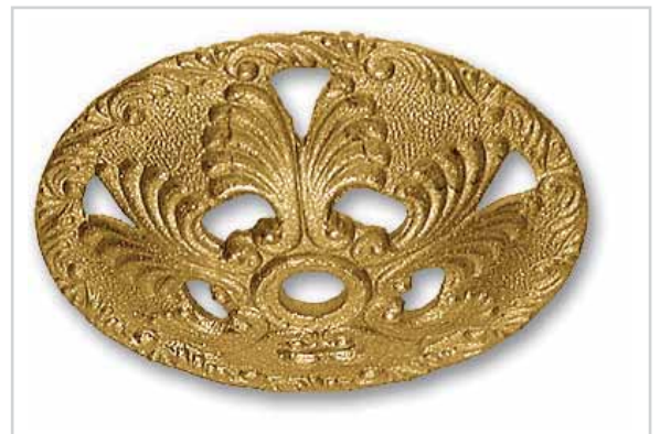
G109 Ø70 x H16 foro/hole Ø10,5 piano sopra/round flat Ø13