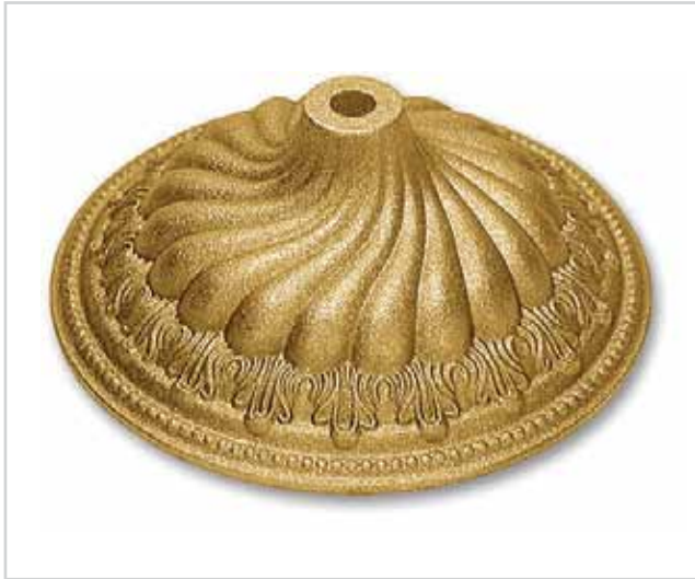
G175 Ø80 x H30 · foro/hole Ø10,5 piano sopra/upper flat Ø12