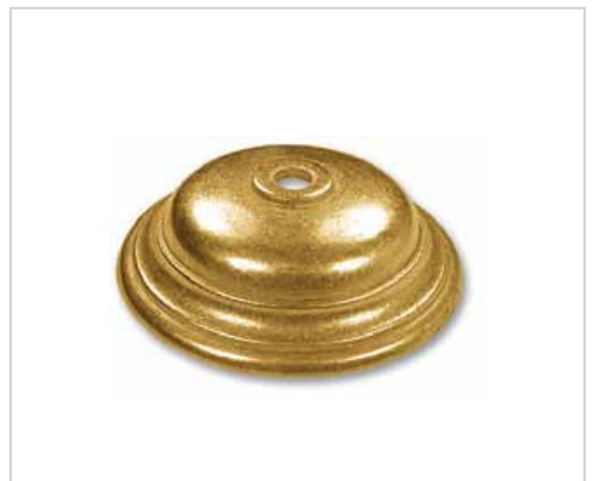
G420 Ø70 x H20 · foro/hole Ø10,5 piano sopra/upper flat Ø14