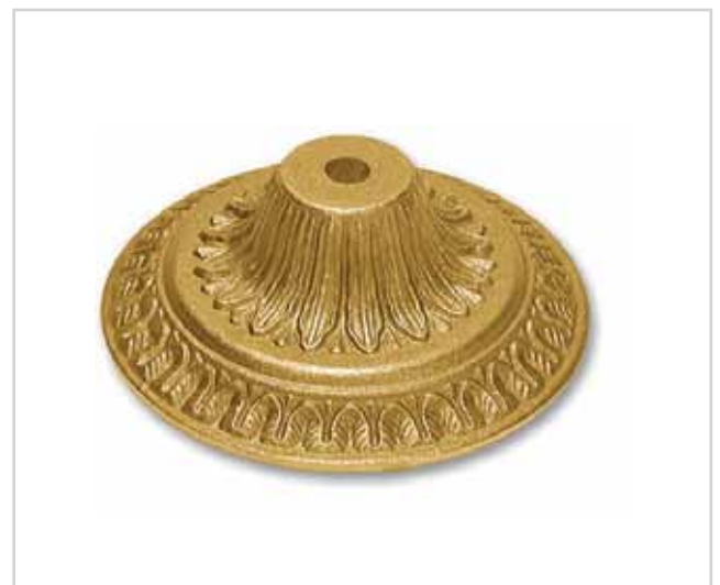
17-017 Ø110 x H39 · foro/hole Ø10,5 piano sopra/upper flat Ø26