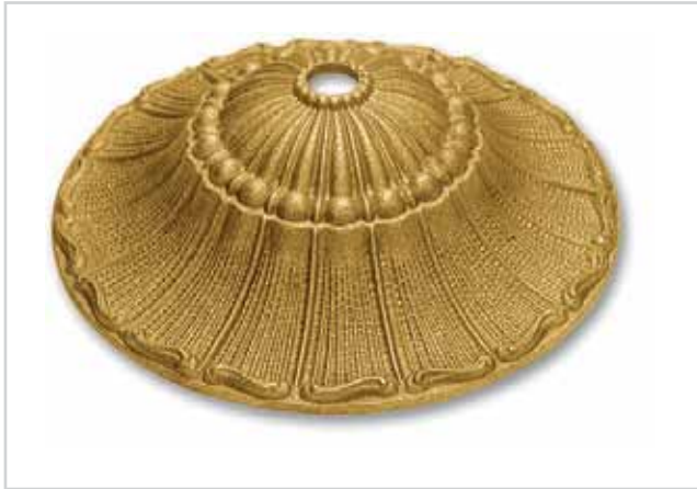
G181 Ø120 x H36 · foro/hole Ø10,5 piano sopra/upper flat Ø15