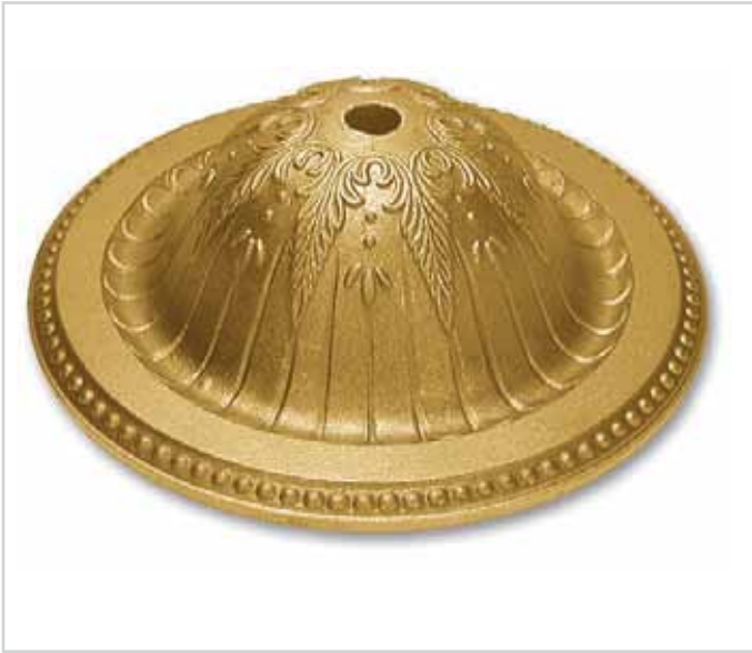
17-015 Ø110 x H34 · foro/hole Ø10,5 piano sopra/upper flat Ø14