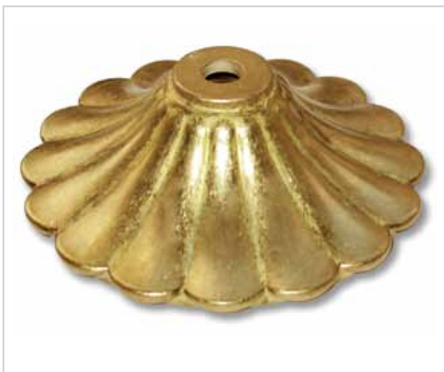
17-095 Ø116 x H38 · foro/hole Ø10,5 piano sopra/upper flat Ø15