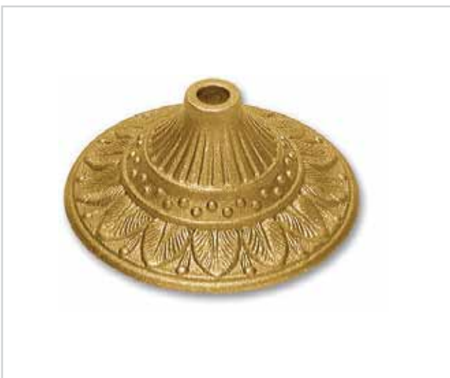
17-016 Ø100 x H42 · foro/hole Ø10,5 piano sopra/upper flat Ø15