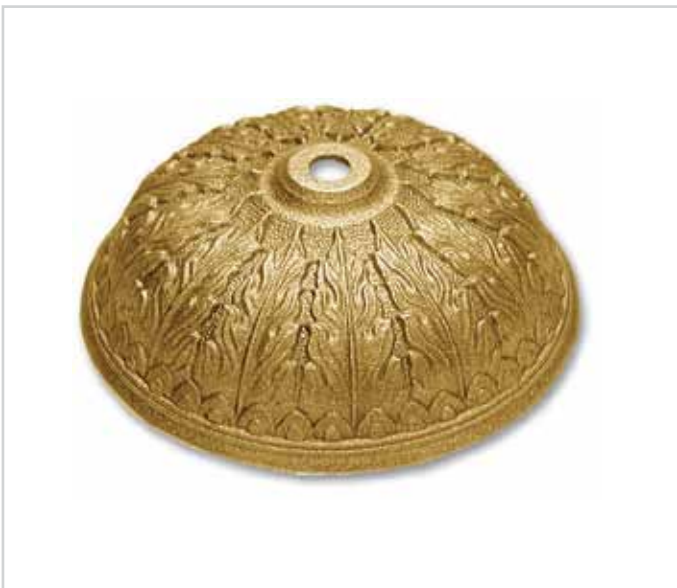
G202 Ø140 x H50 · foro/hole Ø10,5 piano sopra/upper flat Ø20