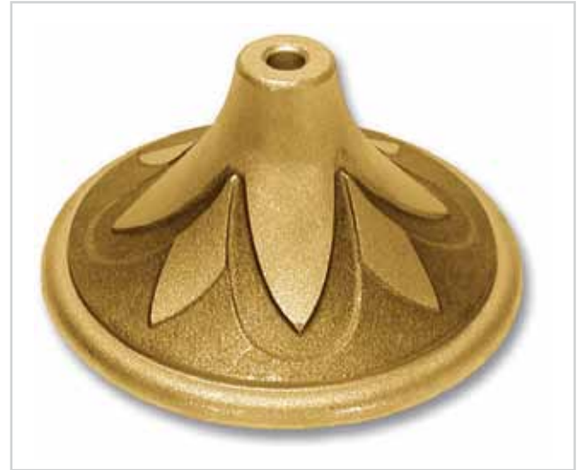
17-060 Ø80 x H40 · foro/hole Ø10,5 piano sopra/upper flat Ø13