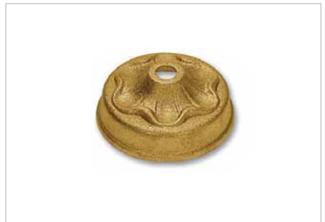
G426 Ø70 x H28 · foro/hole Ø10,5 piano sopra/upper flat Ø15