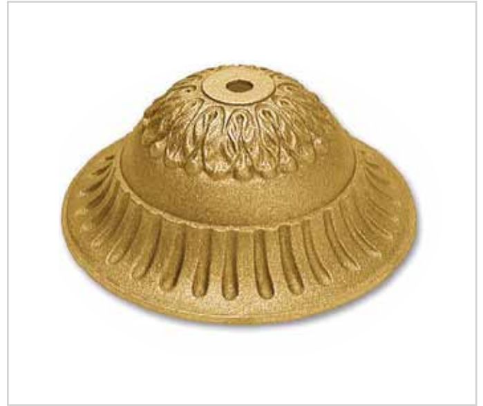
G404 Ø80 x H28 · foro/hole Ø10,5 piano sopra/upper flat Ø15