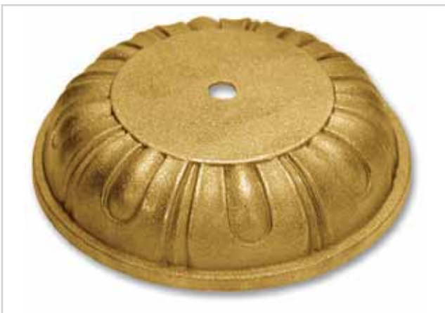
G373 Ø140 x H31 · foro/hole Ø10,5 piano sopra/upper flat Ø75