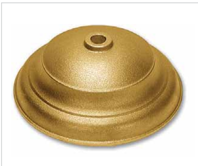
17-048 Ø100 x H34 · foro/hole Ø10,5 piano sopra/upper flat Ø14