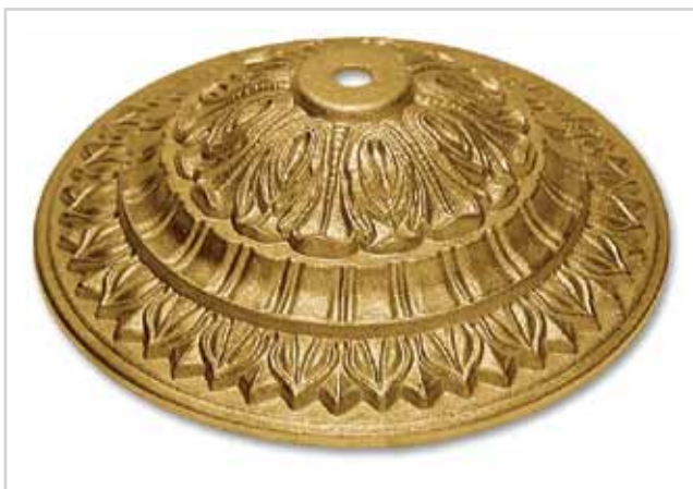
17-032 Ø140 x H40 · foro/hole Ø10,5 piano sopra/upper flat Ø22