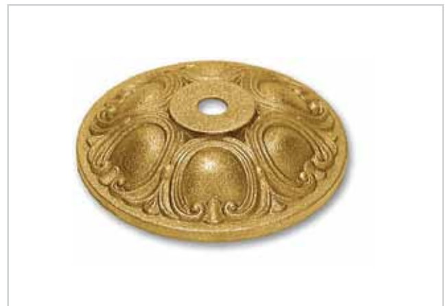
G450 Ø100 x H21 · foro/hole Ø10,5 piano sopra/upper flat Ø25