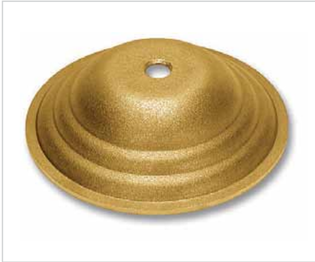
17-054 Ø100 x H25 · foro/hole Ø10,5 piano sopra/upper flat Ø42