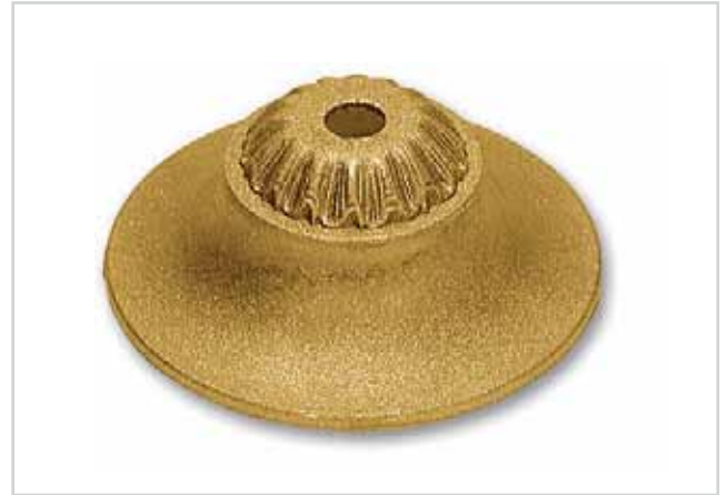
G412 Ø90 x H30 · foro/hole Ø10,5 piano sopra/upper flat Ø17