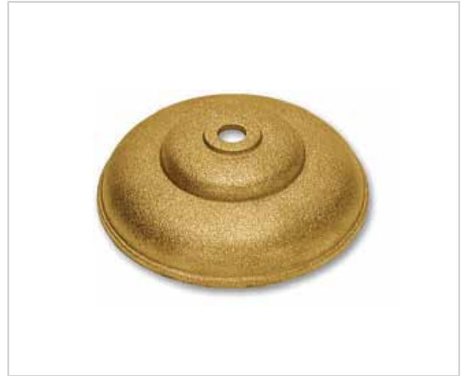
G418 Ø70 x H18 · foro/hole Ø10,5 piano sopra/upper flat Ø13