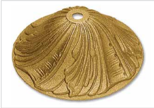
G316 Ø60 x H30 · foro/hole Ø10,5 piano sopra/upper flat Ø13