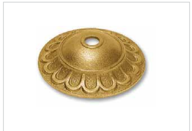
17-012 Ø80 x H22 · foro/hole Ø10,5 piano sopra/upper flat Ø15