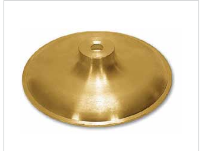
G233 \varnothing 140 \times H33 · foro/hole \varnothing 10,5 piano sopra/upper flat \varnothing 30