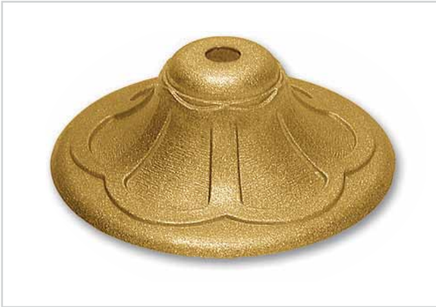
G379 Ø100 x H35 · foro/hole Ø10,5 piano sopra/upper flat Ø18