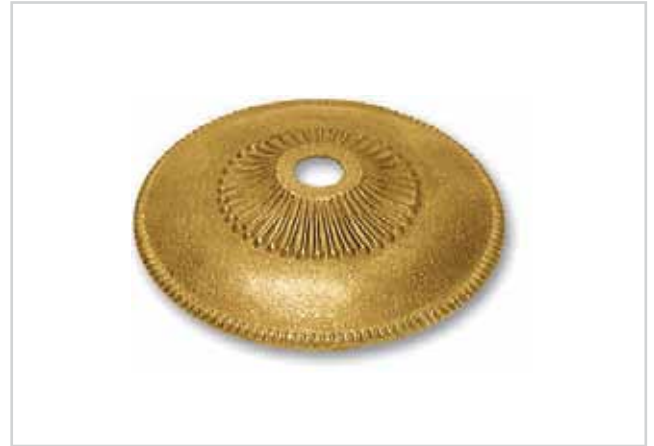
G108 Ø80 x H18 · foro/hole Ø10,5 piano sopra/upper flat Ø17