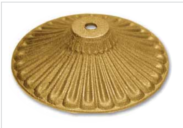
G198 Ø140 x H40 · foro/hole Ø10,5 piano sopra/upper flat Ø30