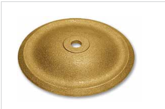
G464 \varnothing 60 \times H7 foro/hole \varnothing 10,5 piano sopra/upper flat \varnothing 13 pressofuso/die casted