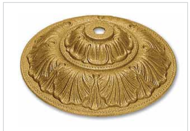
G398 Ø80 x H22 · foro/hole Ø10,5 piano sopra/upper flat Ø15