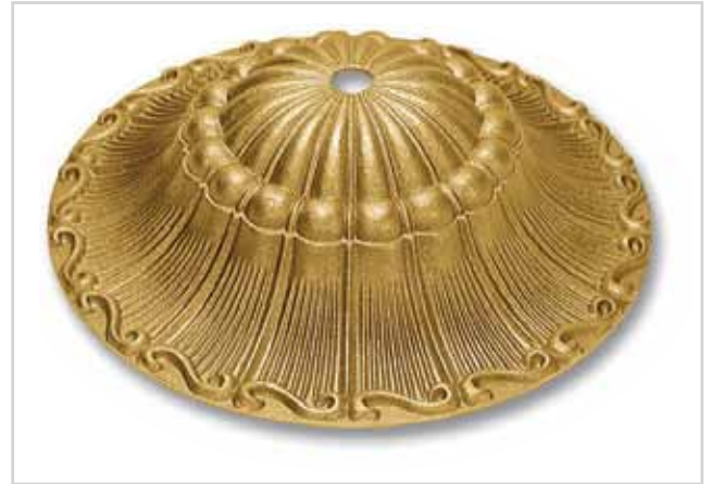
17-030 Ø50 x H15 · foro/hole Ø10,5 piano sopra/upper flat Ø13