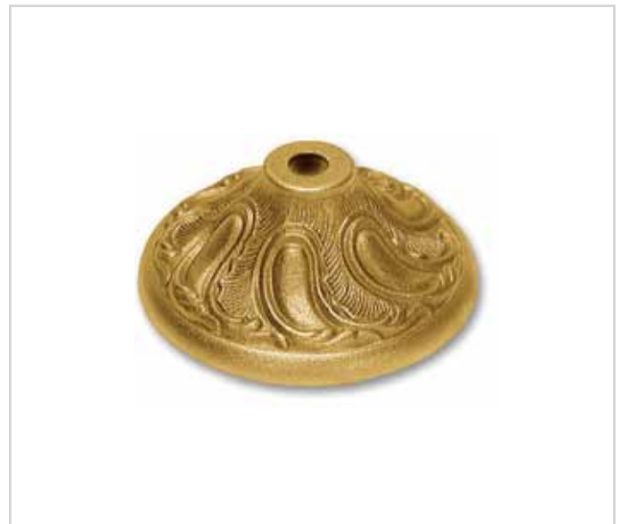
17-055 Ø80 x H34 · foro/hole Ø10,5 piano sopra/upper flat Ø17