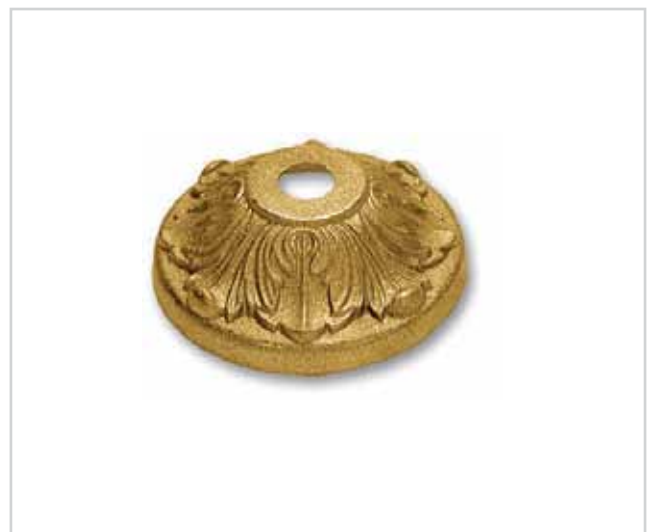
G351 Ø70 x H22 · foro/hole Ø10,5 piano sopra/upper flat Ø24