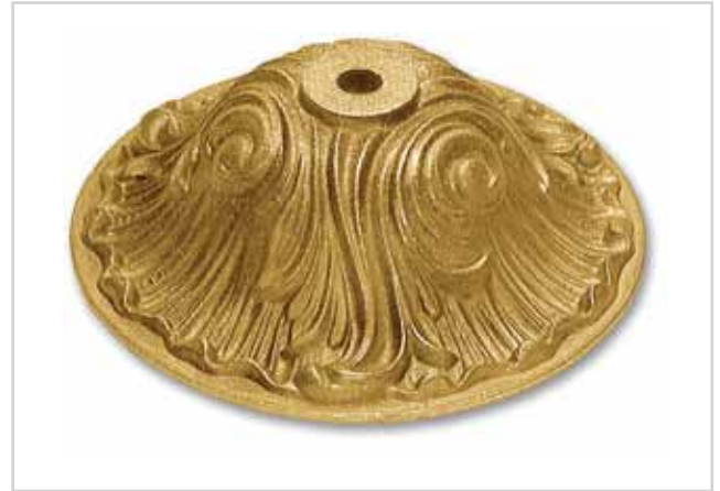
G402 Ø80 x H27 · foro/hole Ø10,5 piano sopra/upper flat Ø15