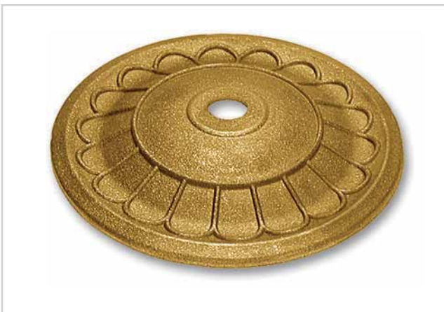
G467 Ø60 x H7 · foro/hole Ø10,5 piano sopra/upper flat Ø13