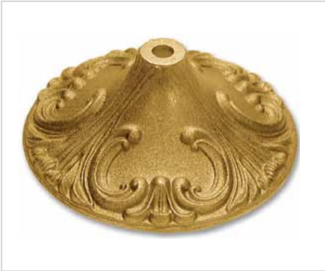
G176 Ø80 x H30 · foro/hole Ø10,5 piano sopra/upper flat Ø11