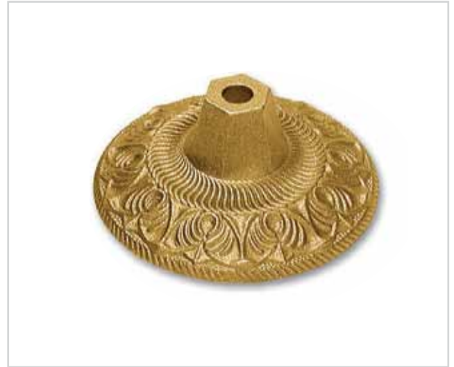
17-018 Ø100 x H40 · foro/hole Ø10,5 piano sopra/upper flat Ø17