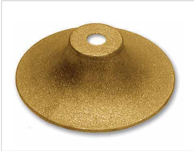
G375 \varnothing 100 \times H30 · foro/hole \varnothing 10,5 piano sopra/upper flat \varnothing 30