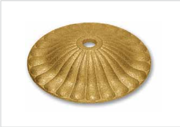
G004 Ø50 x H11 · foro/hole Ø10,5 piano sopra/upper flat Ø12 stampato a caldo/hot pressing