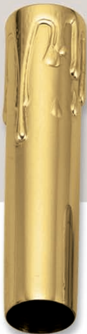
M.46 M.46 M